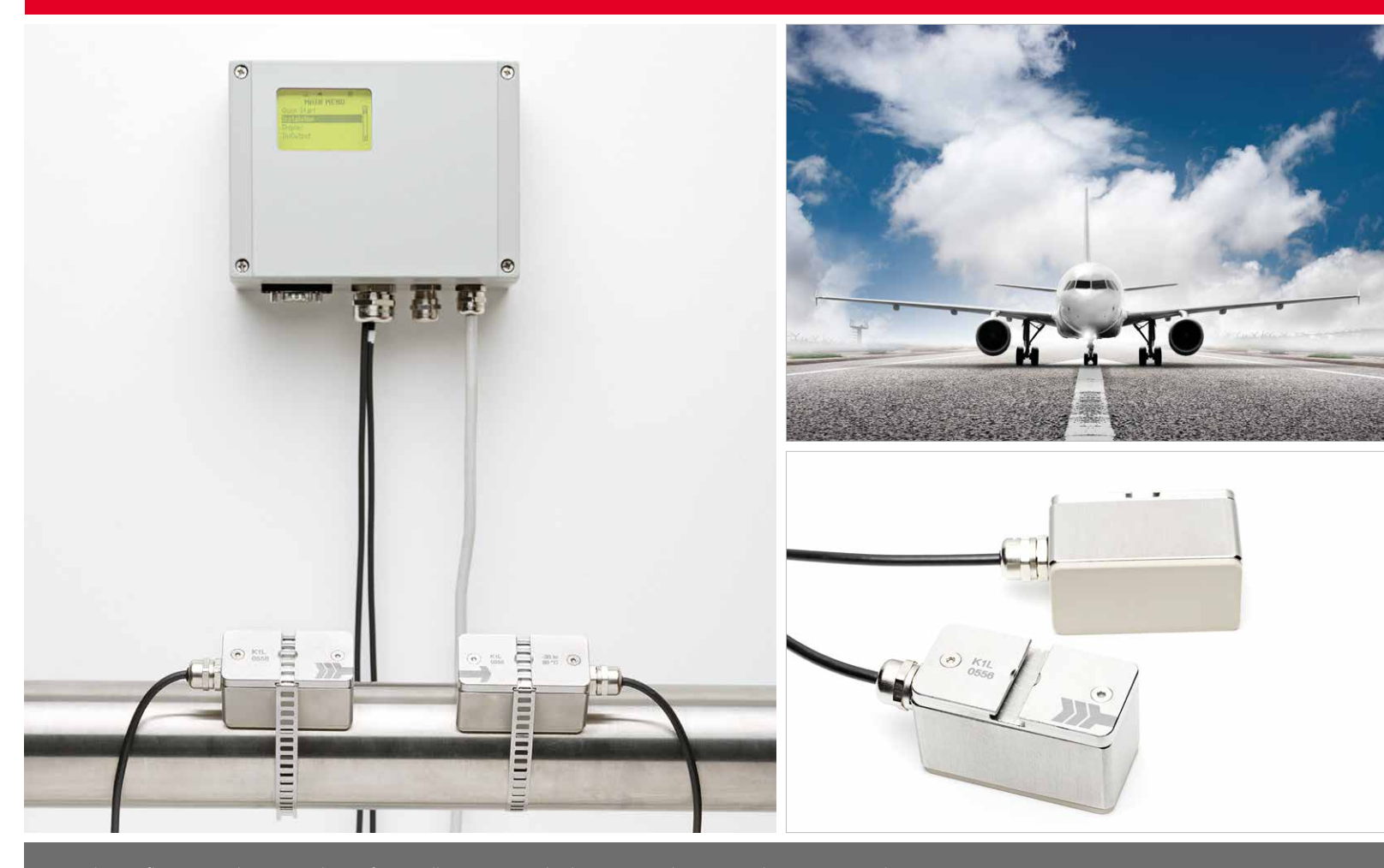
The KATflow 100 and K1L transducers for installation on standard process applications with pipes greater than 2".